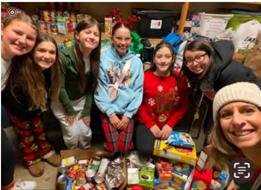
Our student leadership club collecting food items for our local food bank.