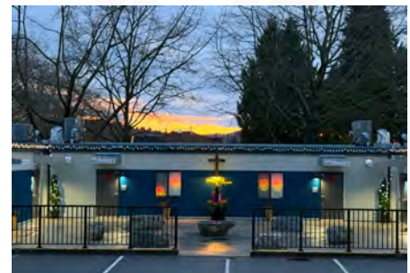
Our modular school decorated for Advent