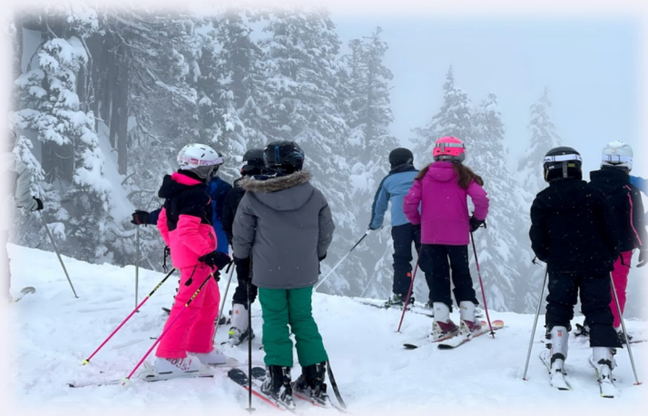
Grade 7 Skiing