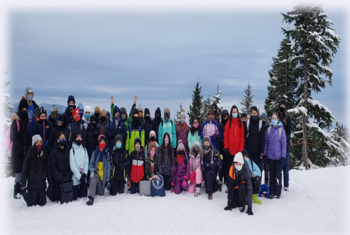
Grade 6 Field Trip