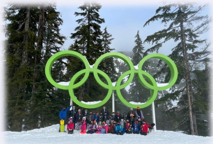
Grade 4 Field Trip and Safety

We are happy to announce that we have arranged a hip hop activity for K-7 during the week of March 1st-5th. All of you will receive a link to preview our students' final routines.