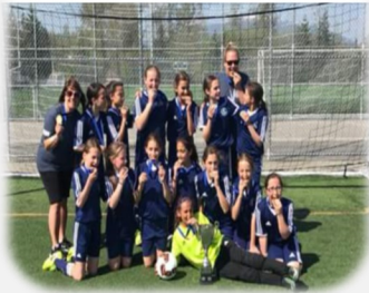
SHS Girls Super 8 Soccer team won a Bronze medal today in the CISVA tournament! Congratulations!!!