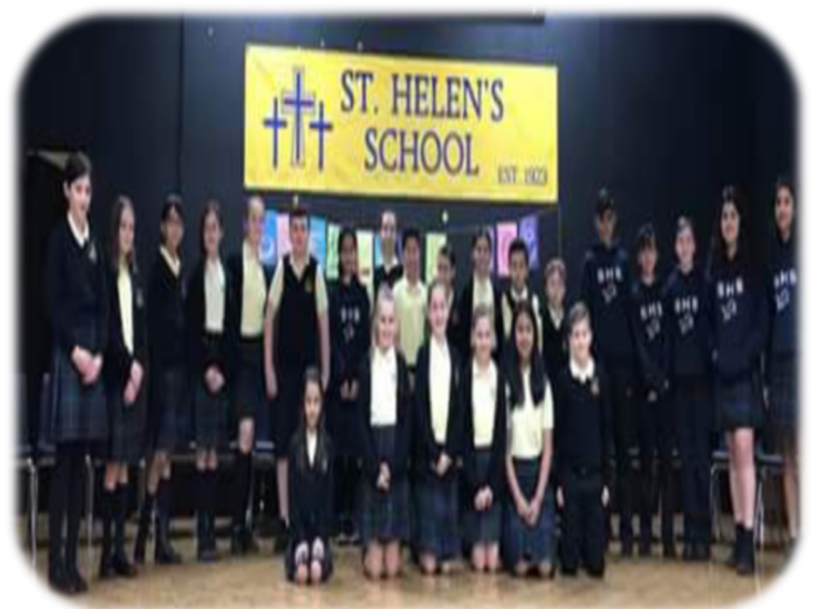
Students from this year's Spelling Bee

Congratulations also goes to our students from grades 5-7 who have been reading selected books since December to compete in the annual Readers are Leaders competition. Our zonal contest took place on April 11th .