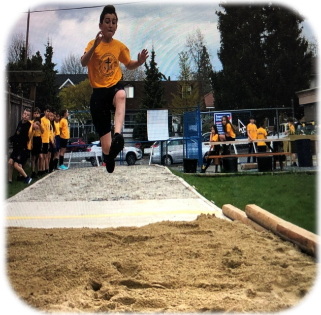
Children enjoying our grass field playground