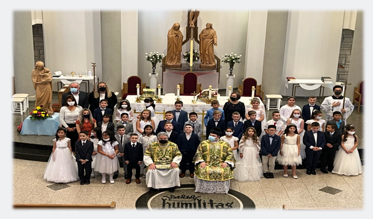
Congratulations to our Grade 3 class which received their sacrament of 1st Holy Communion