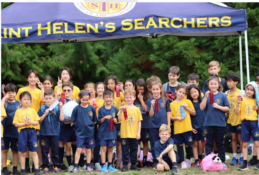
Our Cross Country team getting ready for the CISVA Championship taking place on October 2nd.