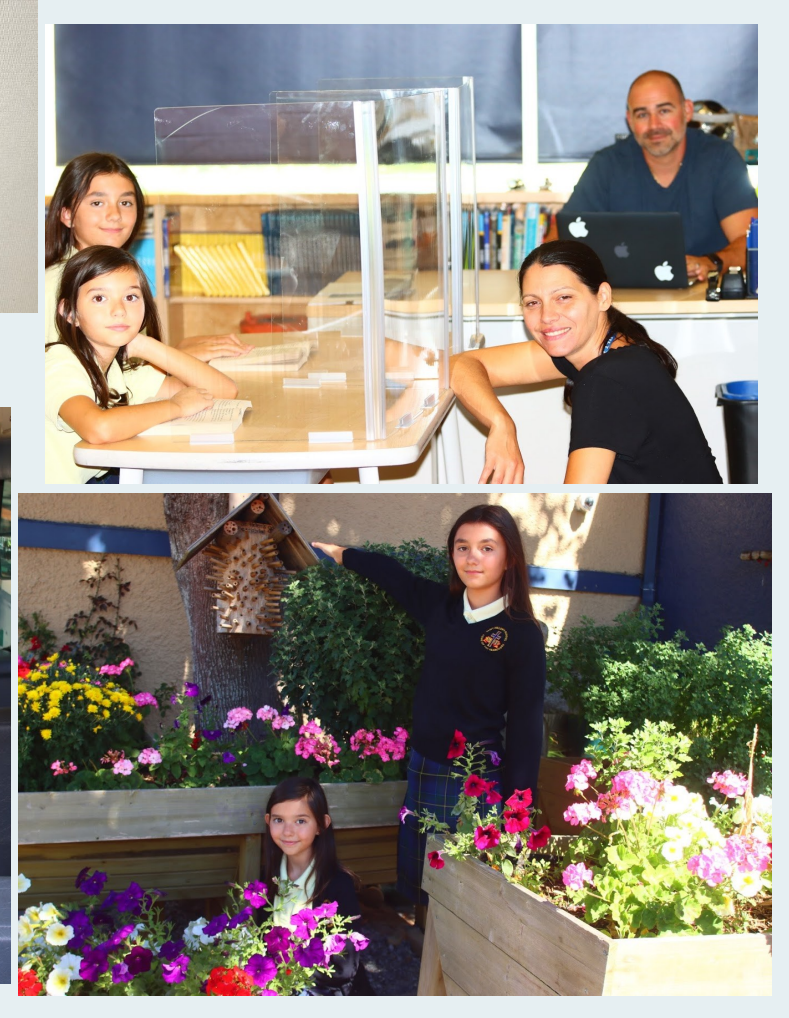
This will be located in our outdoor classroom as well as the primary hallway in the main