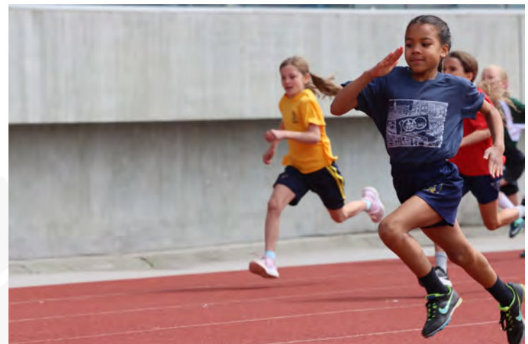
St. Helen's Track Meet