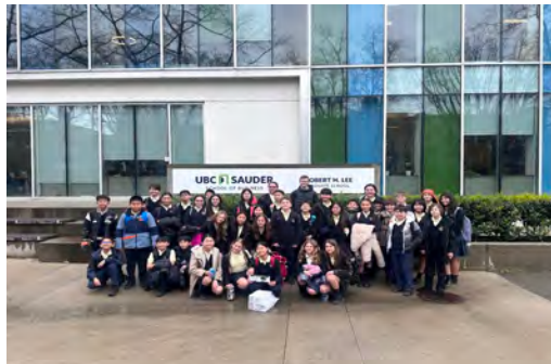
Gr.6's at UBC

More photos can be found on our website at https://www.sthelensschool.ca/photos-2025-2026.php