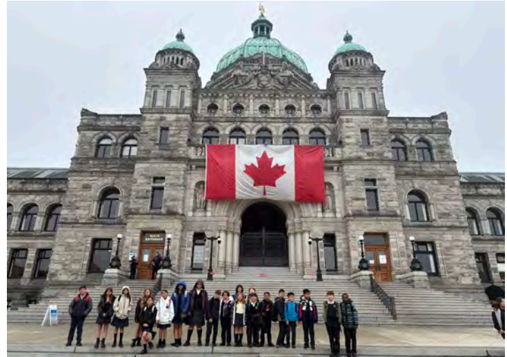
Gr. 5's in Victoria