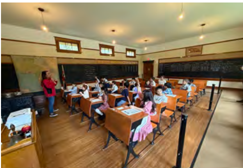
Gr.2's at Burnaby Village Museum