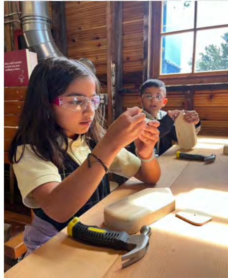
Gr. 2's at the Steveston Ship Yard