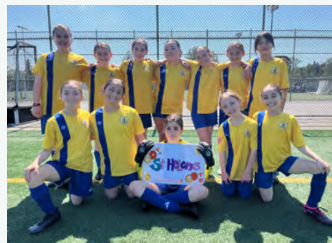
Congratulations to our Juvenile girls soccer team for finishing 4th overall at the big 8 tournament!