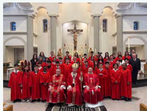
Congratulations to our Gr. 7 students who received the sacrament of Confirmation on Friday, April 17th