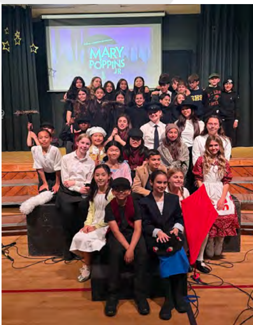
The cast of our Mary Poppins spring musical