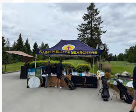
St. Helen's Annual Golf Tournament

Please click here to view photos from our field trips and other school events