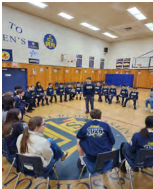
Gr.7 Net Retreat