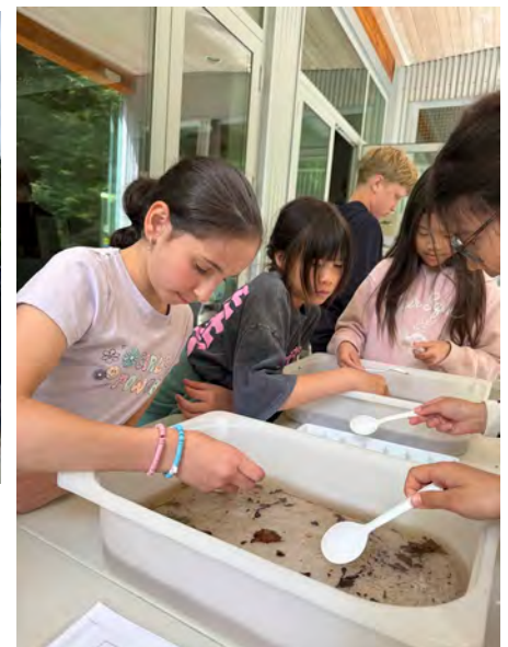
Gr. 4's at the Salmon Hatchery

http://www.sthelensschool.ca/photos-2024-2025.php