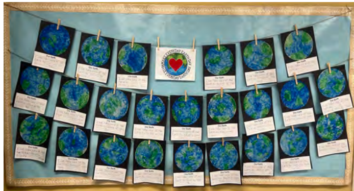
Earth Day Art