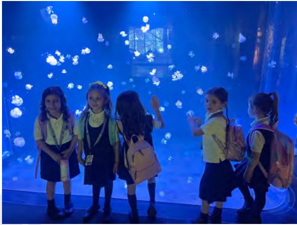
Gr. 1's at the Vancouver Aquarium