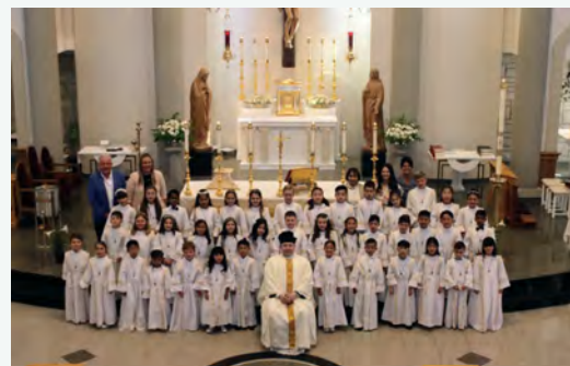
Congratulations to our Gr. 2's who received the sacrament of First Holy Communion on May 4th