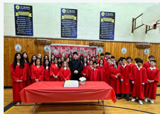
Congratulations to our Gr. 7's who received the sacrament of Confirmation on May 22nd