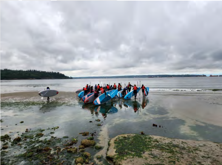
Gr. 7's Paddle Boarding