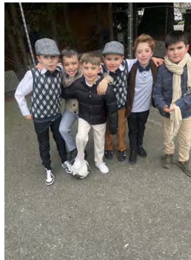
Our primary students and staff celebrated 100's day on February 20th.