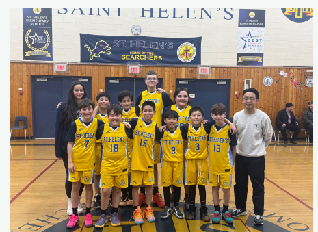
Congratulations to our Junior and Senior Basketball Teams!

We are proud to share that both our Junior and Senior Basketball Teams have advanced to the Olympic Oval for the Annual Basketball Championship.