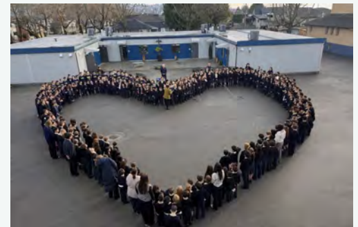
Students and Staff showing their love for Catholic schools week