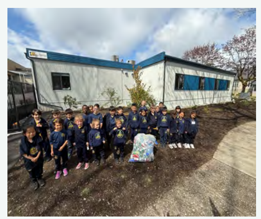
I am incredibly proud of our students, who collected hundreds of recyclable bottles as part of their Earth Week initiative. Their efforts contributed to the planting of three trees in front of the modular school building. Congratulations to all the students for their hard work and commitment to the environment!