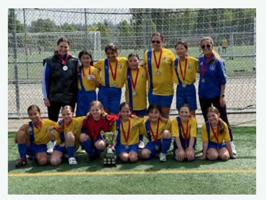
Congratulations to our Juvenile girls who ended up in 2nd place in the CISVA soccer championship!