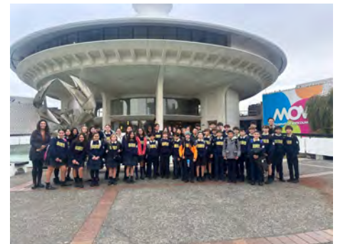
Gr. 7 Field Trip