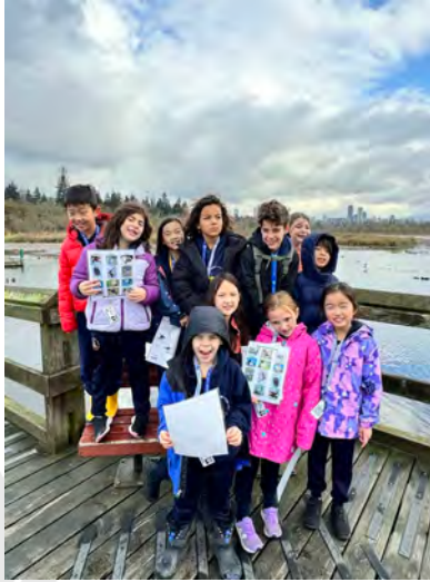
Gr.3 Field Trip

More photos regarding school events and field trips can be found on our school website.